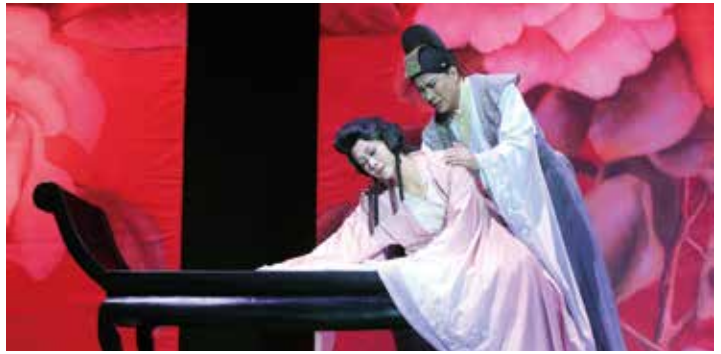
《情話紫釵》 The Liaisons