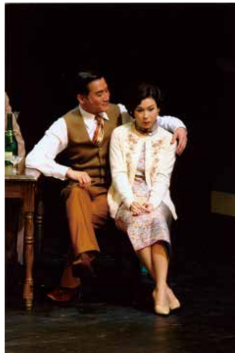
《新傾城之戀》 Love in a Fallen City

今年 10 月，為慶祝香港話劇團 40 周年，毛俊輝將會擔綱主演《父親》一劇；明年更會為香港藝術節策劃 / 導演戲曲節目。毛俊輝一直為推動戲劇及戲曲發展而努力，一路走來，從未言休，足見他對藝術的那份承擔和堅持。